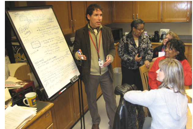
Lancaster School District